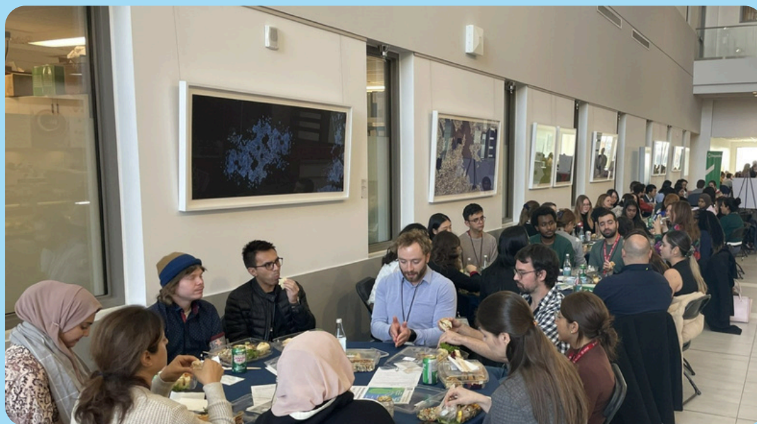
The networking lunch at DCAT's 2023 Career Day provided an opportunity for trainees to connect with professionals from both industry and academia.